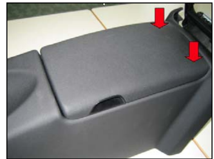
Figure 3 P-B-68.20/43