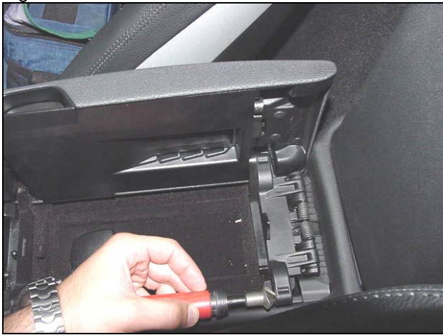
Figure 5 P-B-68.20/43