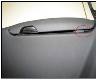
Figure 2 P-B-68.20/43