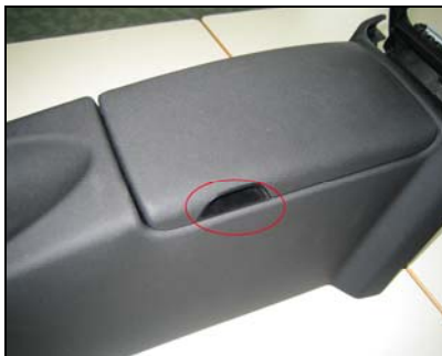
Figure 1 P-B-68.20/43