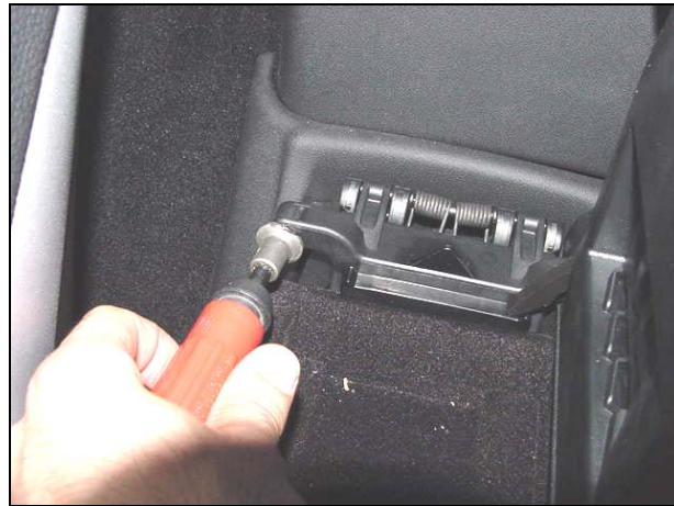
Figure 6 P-B-68.20/43

i Note: The following allowable labor operations should be used when submitting a warranty claim for this repair.